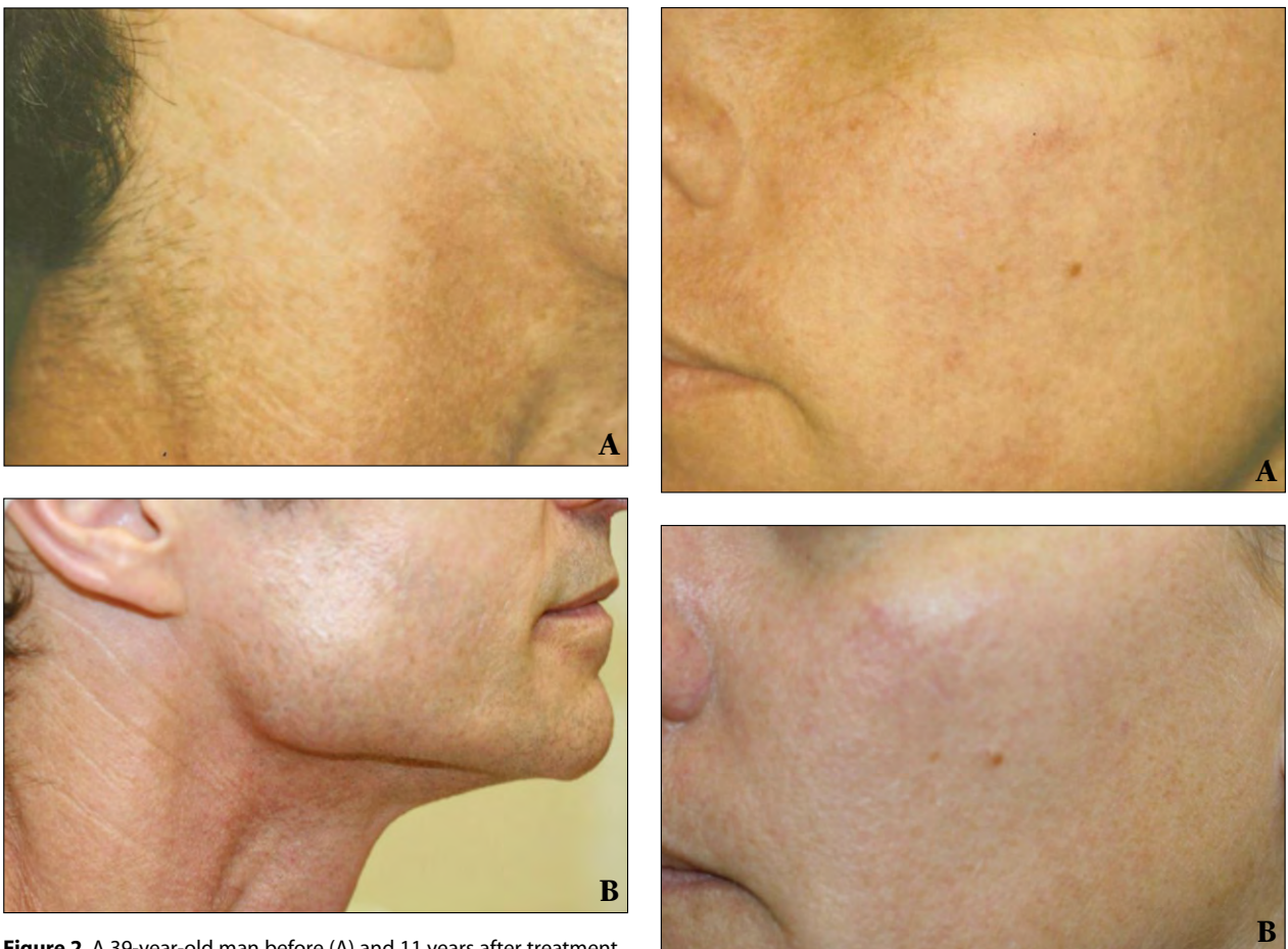
Figure 2. A 39-year-old man before (A) and 11 years after treatment of the right lateral neck with BroadBand Light therapy at least once per year (B).