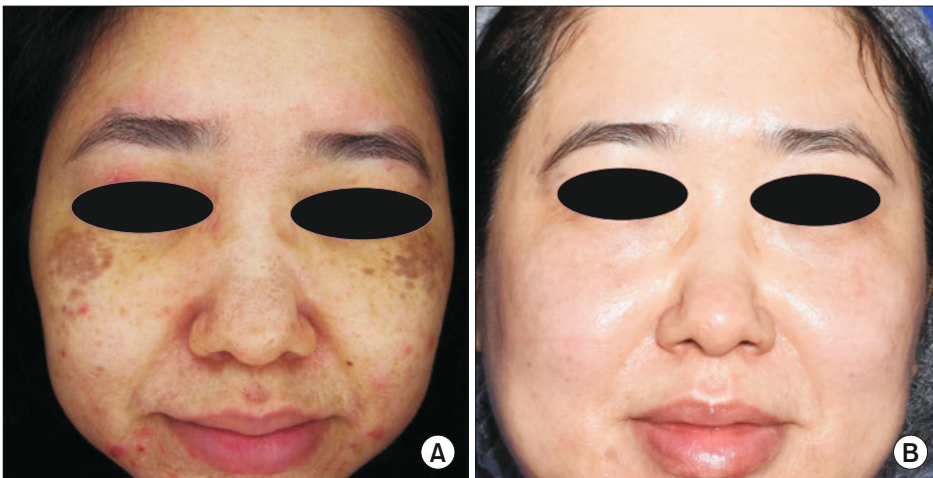
Fig. 3. Clinical remission of acquired bilateral nevus of Ota-like macules (A) compared with the condition before picosecond laser treatment (B).