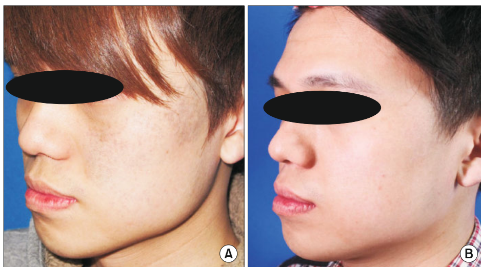
Fig. 4. (A) A 26-year-old male patient who had undergone 9 treatments with the quality-switched ruby laser, showing a plateau phase with some periorbital pigments (panda sign). Note that the patient chose to wear his hair long to cover the facial pigments. (B) The pigments were significantly reduced after 4 treatments with the picosecond laser. Note that the patient had changed his hairstyle accordingly.

Tattoos are common in the Asian population. Although there are no systematic epidemiological studies thus far, cultural changes have precipitated an increase in the number of individuals with tattoos in Asia, like in Western countries, particularly in the adolescent group [33]. Moreover, as eyebrow shape is a very important appearance feature for Asians, eyebrow tattoos are very common. However, a number of individuals later regret their decision to get tattooed. The reasons include a desire to dissociate from the past, unfashionable designs, or poor quality. Therefore, it is useful and important to know how to remove tattoos from Asian skin. As previously mentioned, Asian skin is laser-unfriendly; therefore, it requires PS laser procedures with LIME property. Although PS lasers show a degree of “color-blindness” when compared with QS lasers (probably owing to the PMEs), chromophore selectivity still exists. Thereby, therapeutic laser wavelengths are very important. As described