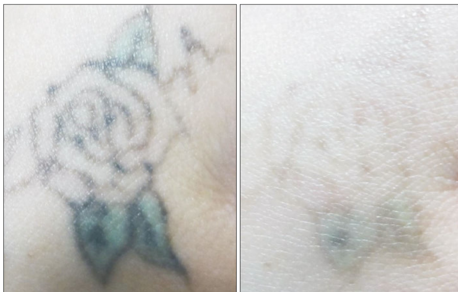
Fig. 6. Tattoo with a plateau effect from traditional quality-switched laser demonstrated further improvement after picosecond laser treatment.