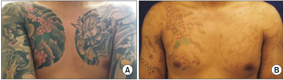
Fig. 7. Treatment of a large tattoo area. Picosecond (PS) laser treatment was effective and caused less pain to the patient during the procedure. (A) Before PS laser treatment. (B) After 6 PS laser treatments.