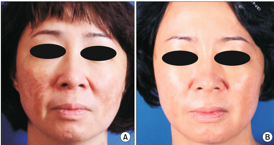
Fig. 2. A case of typical malar facial melasma with vascular components that was successfully improved with picosecond (PS) laser treatment. (A) Before treatment, (B) after 6 PS laser treatments.

Nevus of Ota (NOO) is a pathologically similar but congenital condition occurring in childhood and infancy, affecting up to 2.5% of the Asian population [22]. It presents as unilateral grayish hyperpigmentation on the face and sclera, usually at the trigeminal nerve distribution. Histologically, it consists of speckled elongated dendritic melanocytes with large melanin granules [23]. Therefore, problems in both melanin produc-