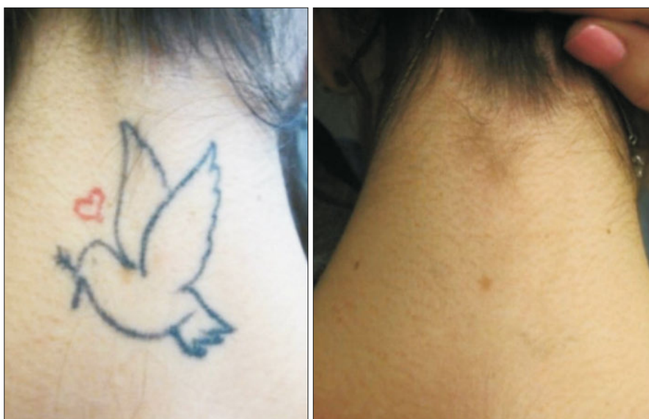
Fig. 5. Nearly complete removal of a tattoo with the picosecond laser.

author's cases, the Kirby-Desai Scale score [35] was 15 and 6 treatments were needed to achieve >80% improvement (Fig. 7). Furthermore, although approximately 90% of the tattoo colors were red and dark blue or black, which are rather efficiently addressed with 532 and 1,064 nm wavelengths, there is an increasing utilization of new colors such as green and light blue, which are better absorbed by wavelengths of 670, 755, or 785 nm. There is evidence that PS lasers in this wavelength range can effectively remove blue and green colors. Nonetheless, among all these wavelengths, the absorption coefficient of 670 nm for blue and green is the highest (Fig. 8). When compared