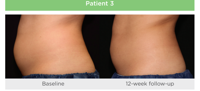
Figure 4. Patient 3 with before (left) and after (right) photos collected at 12 weeks after a single treatment.

Results of the GAIS assessment at twelve weeks following the first treatment indicated 87% of patients had mild to significant improvement results. Patient self-report survey revealed 75% and 25% of patients were either extremely satisfied or satisfied after a single treatment, respectively. Furthermore, 87% of patients were likely to recommend truSculpt iD to others.