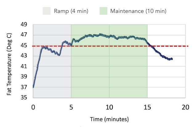
Figure 5. Patient subcutaneous fat temperature measurement throughout the treatment duration. Temperatures were maintained above 45°C which is within the adipolysis range.